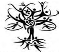
Legacy of Faith: Roots to Wings